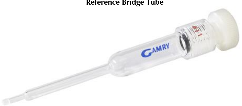
Figure 3 Reference Bridge Tube

Many experiments do not require a "true" reference electrode to be run. If a pseudo- or quasi-reference electrode is sufficient, you do not need to use the reference bridge tube.