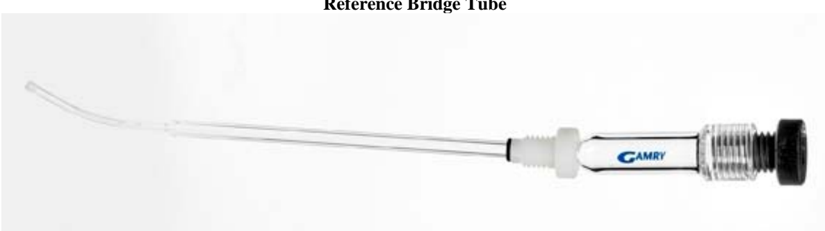
Figure 3 Reference Bridge Tube

Insert the reference electrode into the #11 thread at the upper end of the bridge tube. It must contact the test solution inside the tube. Various reference electrodes that work with this system are available. Contact us for details.