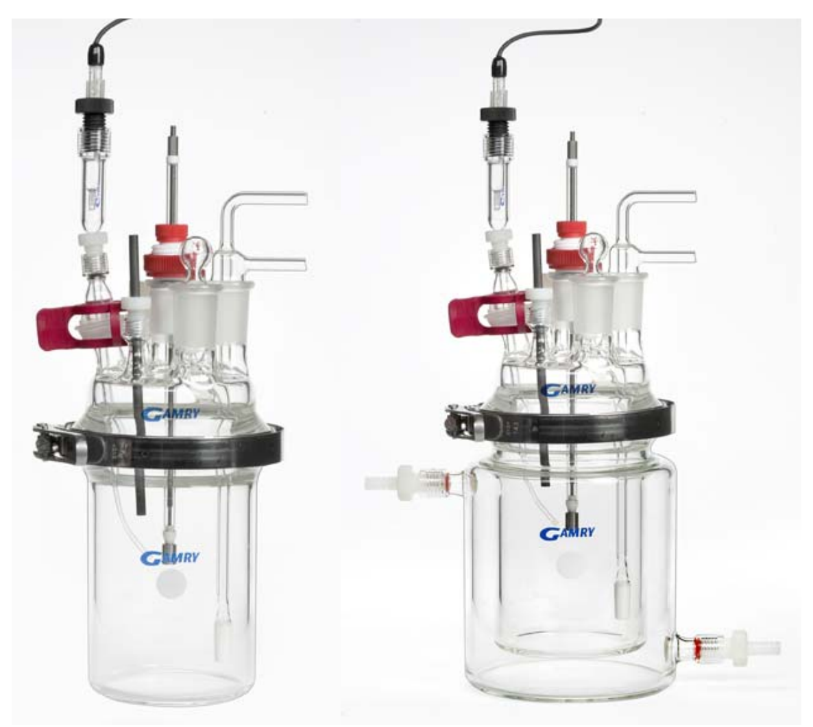
Figure 1 Assembled Cell: Standard and Jacketed Versions

The MultiPort includes a number of ACE-Thred connectors used for a wide variety of functions. #7 ACE-Thred connectors are particularly common. ACE-Thred fittings are designed to seal cylindrical objects into the cell. These objects can include glass tubes, glass plugs, thermometers, and plastic electrode bodies. ACE-Threds are designed to be tightened with finger pressure only.