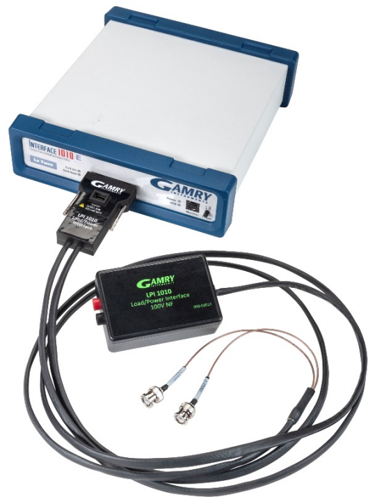
Representative image of Gamry Interface 1010E and LPI1010 100V NF.