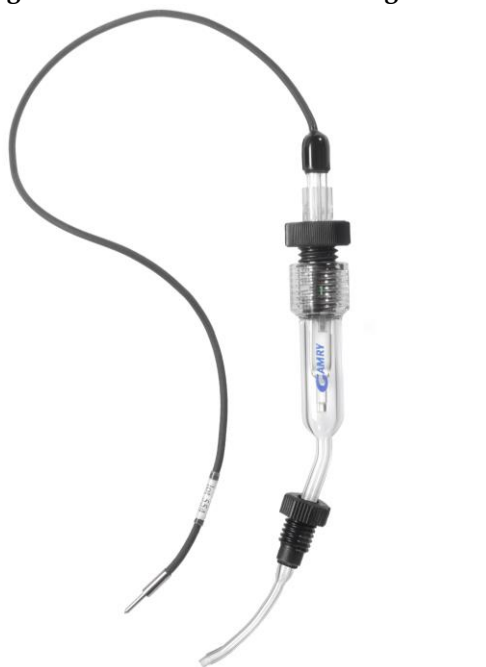
Figure 5. Reference Electrode Bridge Tube.

EuroCell does not include a reference electrode, because different tests may call for different reference electrode types. The reference electrode shown in Figure 5 is Gamry's standard saturated calomel reference electrode (SCE) P/N 930-00003. Gamry also offers an Ag|AgCl Reference (P/N 930-00015) and a Hg|Hg 2 SO 4 reference (P/N 930-00029). Contact your local Gamry sales representative if you need a new or a replacement electrode.