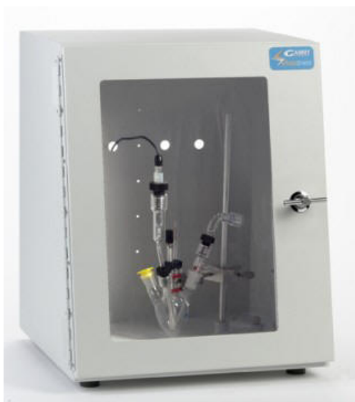
Gamry VistaShield Faraday Cage

Why, any of them! We would certainly be very happy if you chose to use Gamry's VistaShield Faraday Cage. We think that it offers lots of versatility and sits handsomely on your laboratory benchtop.