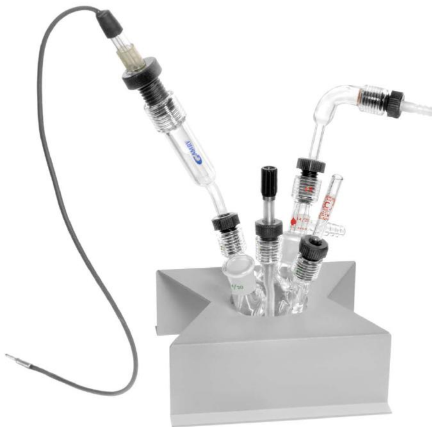
Figure 1 The Standard Configuration of Dr. Bob's Cell

You should pay careful attention to cell cleanliness. In most electrochemical testing situations, contaminants in the cell and test solution can lead to poorly reproducible results.