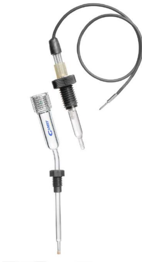
Figure 5. Bridge Tube and Reference Electrode Assembly

Dr. Bob's Cell can be used with 3 rd party reference electrodes, as long as the reference electrode diameter is between 9 and 10.5 mm.