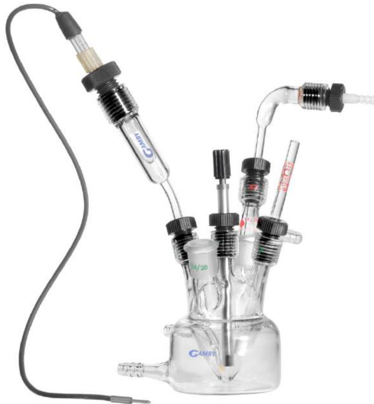
Figure 2 Picture of Jacketed Dr Bob's Cell Configuration

A given ACE-Thred size can only accommodate specific diameter objects. A #7 ACE-Thred is specified to work with object with a diameter between 6.5 mm and 7.5 mm. If you need to add non-standard options to your Dr. Bob's Cell kit, make sure you are aware of this restriction.